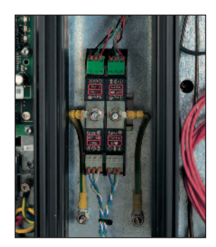
Two ESP 15H protectors mounted in a control cabinet and earthed via the cabinets' earthed chassis