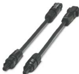
TLK-003 MC4-SunClx Adaptor Kit