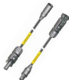
TLK-002 MC4-MC3 Adaptor Kit