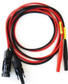
TLK-001 MC4 Connector Kit