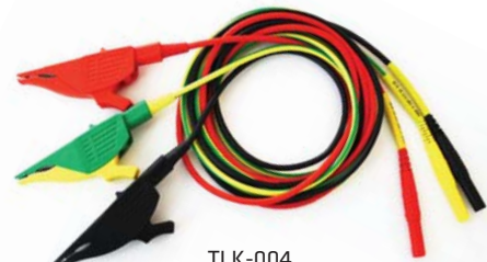
TLK-004 Banana 4 mm - crocodile test lead Kit