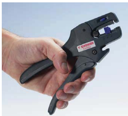
EMBLA, ergonomically designed cutting- and stripping tool.

Elpress stripping tool EMBLA is a self-adjusting cutting and stripping tool for modern electrical installation. The tool strips a wide range of insulations from PVC to PTFE and takes 0.02-10 mm 2 with just one tool. The ergonomic design of the tool has result in a lightweight but strong and comfortable tool equally qualified for high volume production and portable/field usage.