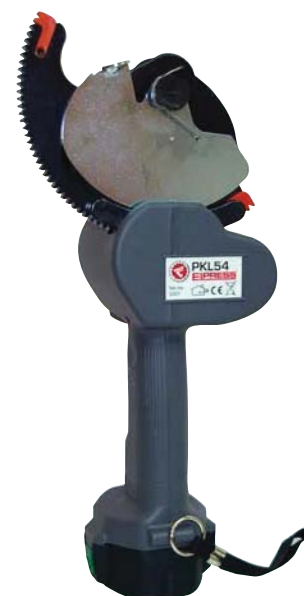
PKL54, cutting tool.

Elpress cutting tools are available in several variants for cutting of Cu and Al conductors, up to a diameter of Ø85 mm. Apart from the mechanical cutting tools that cut cables up to Ø20 mm, there is a wide range of hydraulic cutting tools which cuts cables up to Ø85 mm. The electrical cutting tool PKL54 is easy to operate and the protective cap gives high safety for the user. The tool has a preferable scissor action while cutting and cut conductors up to Ø54 mm.