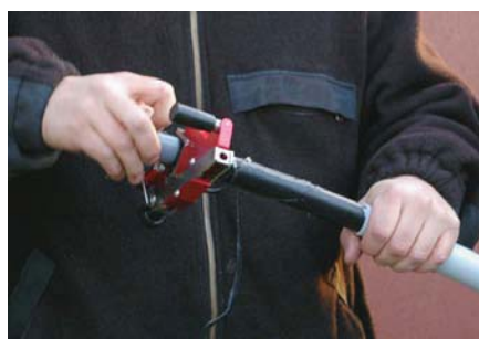
FBS1722, for stripping of outer conductive layer gives a very smooth result.

For preparation and stripping of medium voltage conductors, 12-24kV, tools FBS1722 and 1723 are used. FBS1722 strips (Ø10-50 mm) outer conductor screen of XLPE conductors and FBS1723 strips (Ø15-52 mm) PEX insulation on intermediate voltage conductors.