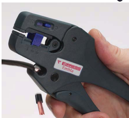
EMBLA, ergonomically designed cutting- and stripping tool.