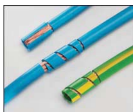
Three stripping functions.