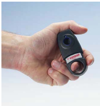
ODEN, precise setting for the different insulations is easily made by means of the nine position setting wheel.

The precise stripping tool ODEN, strips cables Ø2,5-11 mm, is used for stripping of the outer layer for signal cables and the like.