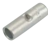
Mechanical Straight Connector